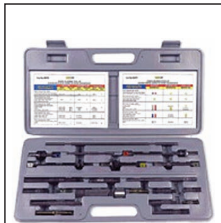
Honda Bushing Installer/Remover Kit, part number 28999

Product Offering: Our product offering has changed over the years. Bryco by Carfel™ was known for offering the hard to find items. In 1995, we developed a Honda Bushing Installer/Remover Kit, part number 28999. We stocked so many of them that it took us a painfully slow process of ten years to sell them all. But then, in 2008, we began receiving calls asking for this kit again. The problem was we had already discontinued this kit because it was such a slow moving item. However, you explained to us that ‘now’ the bushings need to be replaced in almost every unit and