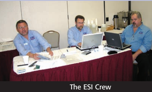
The ESI Crew