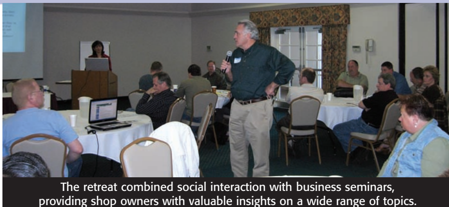
The retreat combined social interaction with business seminars, providing shop owners with valuable insights on a wide range of topics.

To learn more about ProfitBoost and next year's retreat, stop by their web site, at www.profitboost.com .