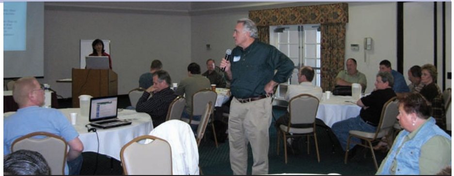
The retreat combined social interaction with business seminars, providing shop owners with valuable insights on a wide range of topics.

To learn more about ProfitBoost and next year's retreat, stop by their web site, at www.profitboost.com .