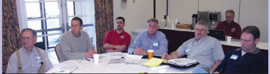
Shop owners from all across the US and Canada met in Chandler, AZ, for a business retreat sponsored and presented by ProfitBoost, LLC.