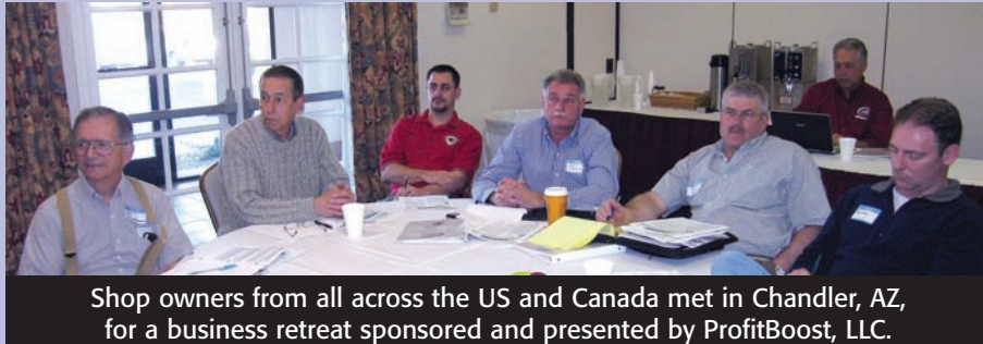
Shop owners from all across the US and Canada met in Chandler, AZ, for a business retreat sponsored and presented by ProfitBoost, LLC.